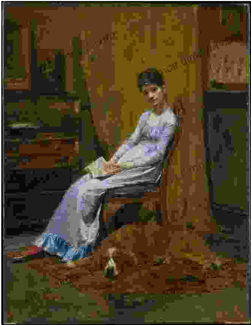
Thomas Eakins, Portrait of a Lady with a Setter Dog , 1885. Oil on canvas.

Eakins's portraits are renowned for their psychological depth and emotional resonance. In works like "Portrait of a Lady with a Setter Dog" (1885) and "The Thinker" (1887), he skillfully captures the complexities of the human character, revealing both vulnerability and strength. His portraits transcend mere likeness and become profound explorations of the human condition.