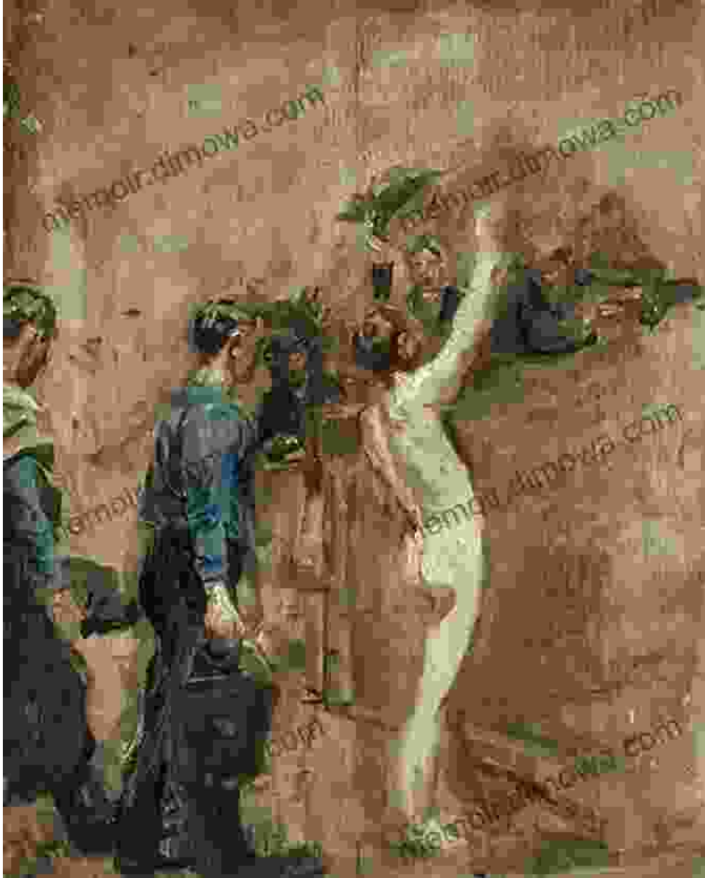
Thomas Eakins, Salutat , 1898. Oil on panel.