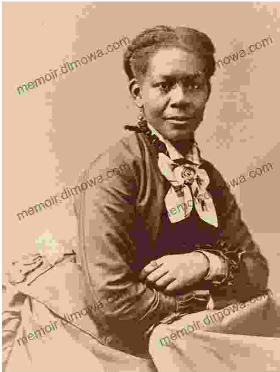
L. of C. African American woman facing front, circa 1870-80

The book delves into the historical roots of African American women's fiction, tracing its evolution from the era of slavery to the present day. By