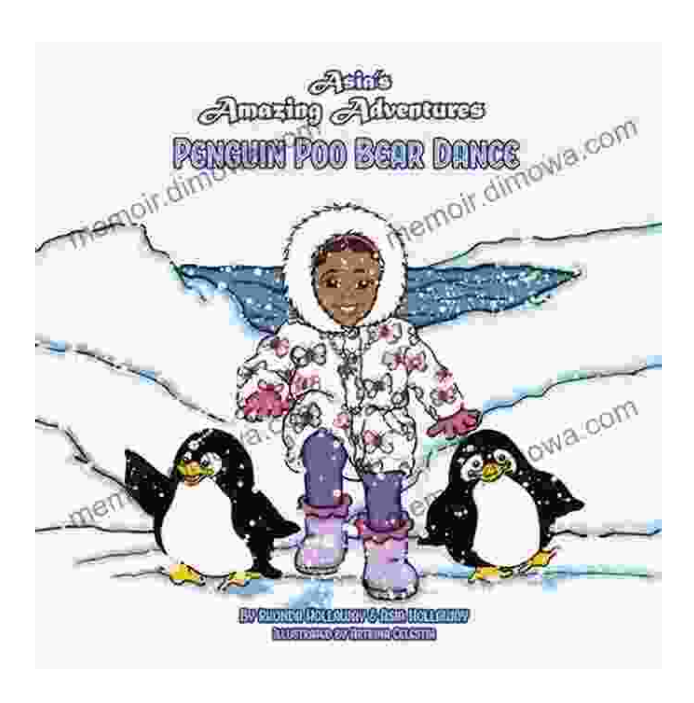
Captivating Illustrations that Bring the Story to Life

As their bond deepens, Pip and Percy encounter a cuddly teddy bear named Bumbles, who is shunned by the other toys for being different. Together, the unlikely trio embarks on a mission to prove that true friendship transcends appearances and embraces individuality.