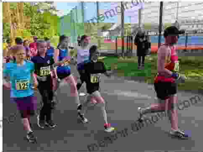
Start of the Metro Harriers Open Skim Walk - Douglas on 15th May 2022