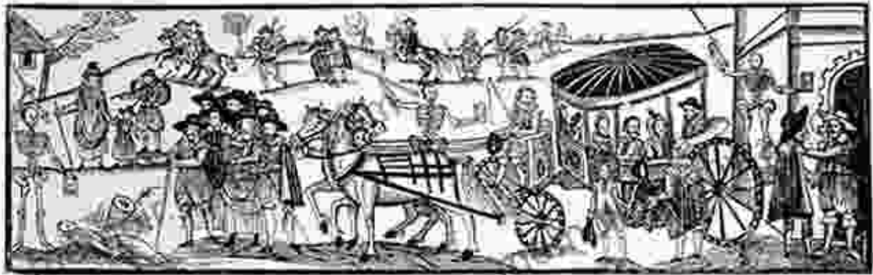
ILLUSTRATION: PERHAPS FROM THE PLAGUE