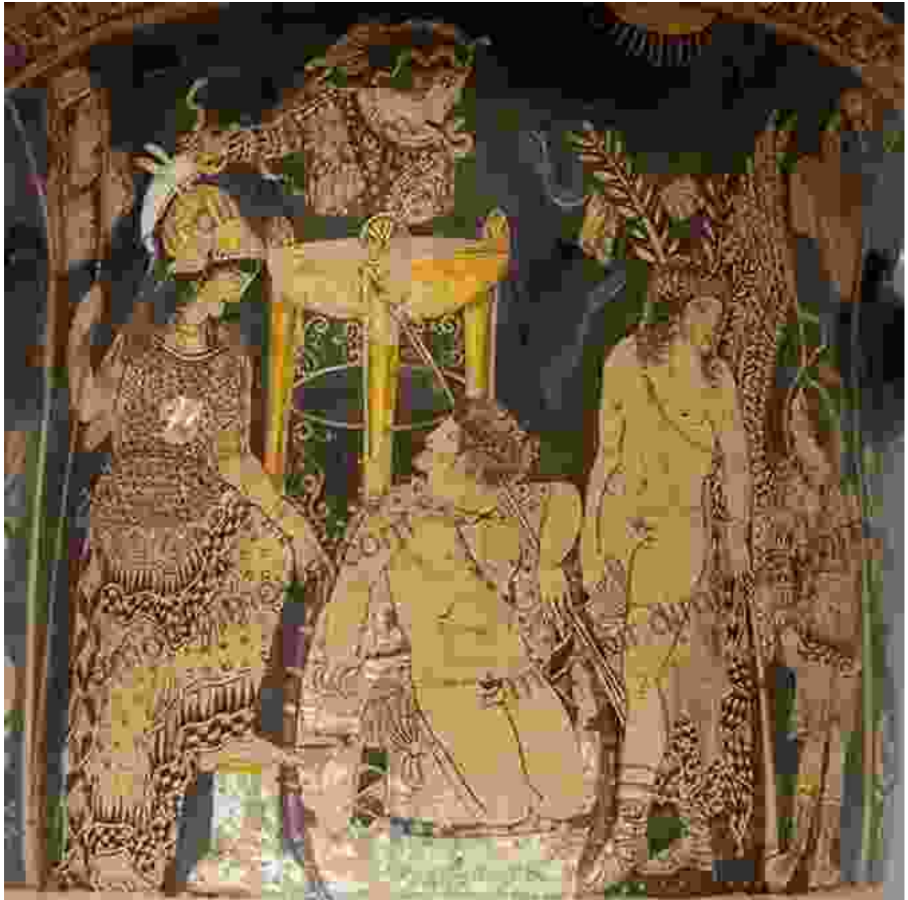
: The Darkness of the Furies